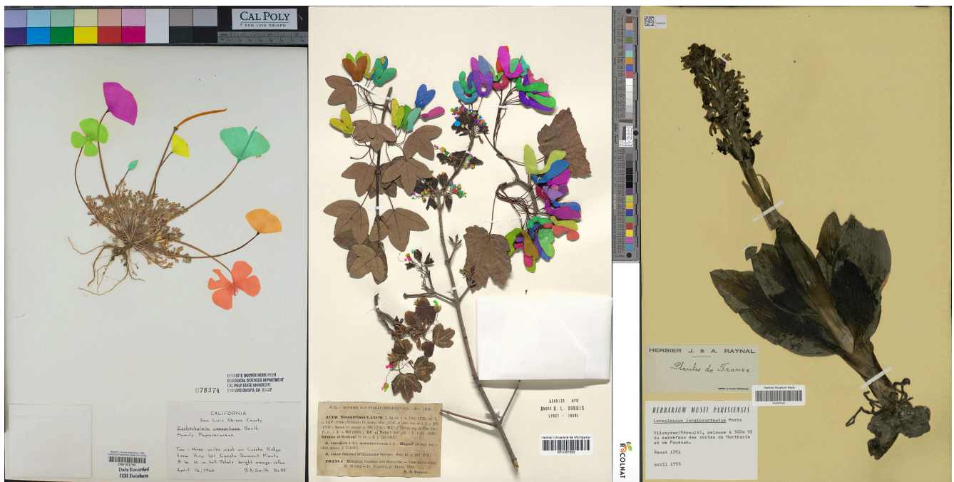
Figure 2. Examples of herbarium specimens displaying visual heterogeneity (e.g., in morphology, labels, and color standards) and challenges related to the morphology and position of reproductive structures. The specimen on the left shows large, isolated reproductive structures that would likely be annotated successfully by ML algorithms. The specimen in the center with small flowers and numerous overlapping fruits would be much more difficult for ML algorithms to parse. The specimen on the right would be very difficult for ML algorithms to delineate or count because of the unclear distinction between flowers and buds. Examples of segmentation masks (see the glossary in box 1) created to delineate reproductive structures are shown by the brightly colored areas in the left and center specimen images.

worldwide are not digitized. Continued digitization of herbarium specimens is needed, particularly of phylogenetically and morphologically diverse collections that can reflect visual variation among specimens and therefore enable the creation of more versatile training data sets.