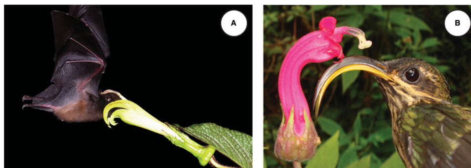
Figure 1. Bat and hummingbird pollination characterize flowers in the centropogonid clade. (A) Centropogon nigricans , a bat pollinated species, is visited by Anoura fistulata . (B) Centropogon umbrosus is shown with Eutoxeres condamini , its obligate sicklebill hummingbird pollinator.

Muchhala 2008; Fleming et al. 2009). Thus, despite the additional cost, there are many cases in which pollination by vertebrates would be selected for, including at high elevations in tropical latitudes where insect diversity declines with increasing elevation (Cruden 1972).